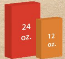
Totals 36 oz.