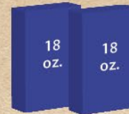
Totals 36 oz.