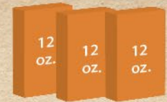
Totals 36 oz.